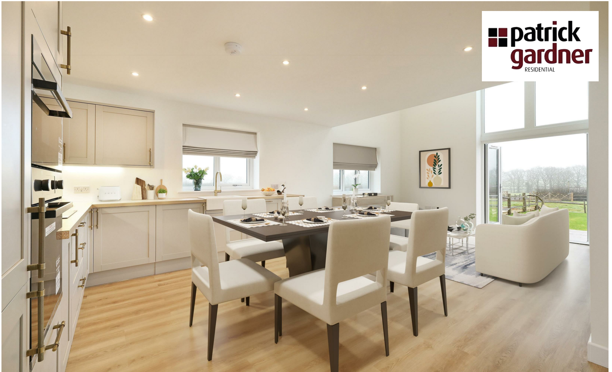
Kites Barn, 15b Reigate Road, Sidlow, Surrey, RH2 8QH